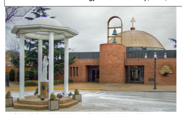
VISITATION OF THE VIRGIN TO ELIZABETH