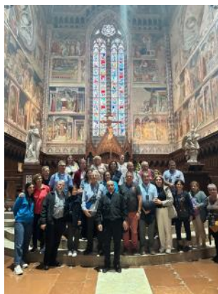
(Photos of the pilgrimage of the Eparchy of Our Lady of Lebanon of Los Angeles at Bolsena and Orvieto, Oct. 2024)