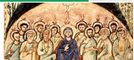
Rabbula Gospels 586 AD