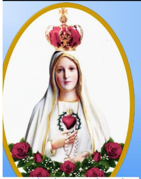
"Honoring the 100th Anniversary of Our Lady's Request for First Saturday Devotion to Her Immaculate Heart" Dec 10, 1925

Where: St Raymond - St Elizabeth Maronite Catholic Church