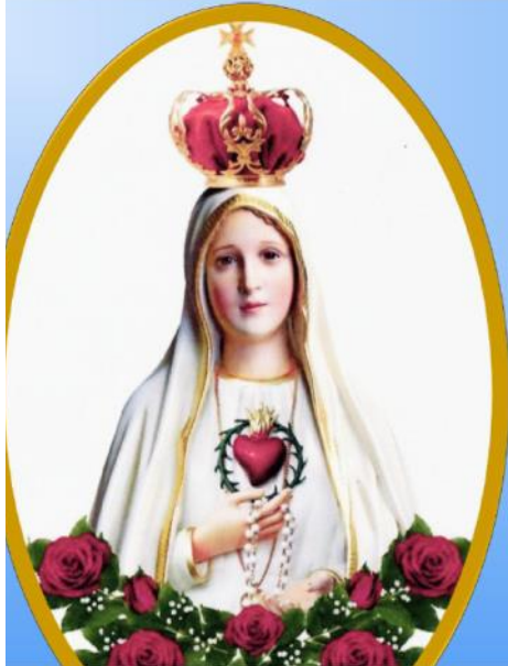
"Honoring the 100 th Anniversary of Our Lady's Request for First Saturday Devotion to Her Immaculate Heart" Dec 10, 1925

Where: St Raymond – St Elizabeth Maronite Catholic Church